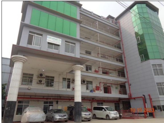
Factory List: 1. DIPS APPARELS LIMITED (RELOCATED) (24874)