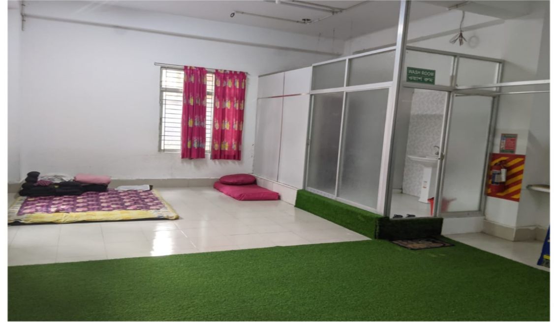
Child Care Room